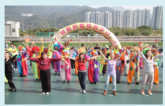
Performers danced with smiles and joy in the parade of the Charity Walk \,